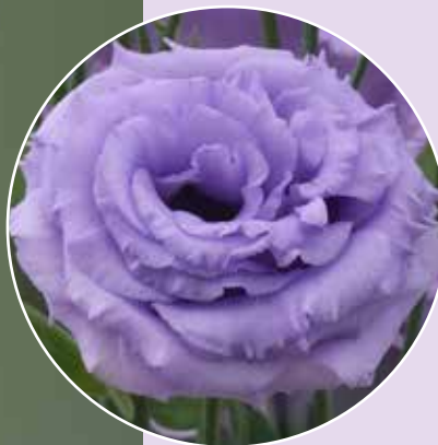
3 Lavender FRS711