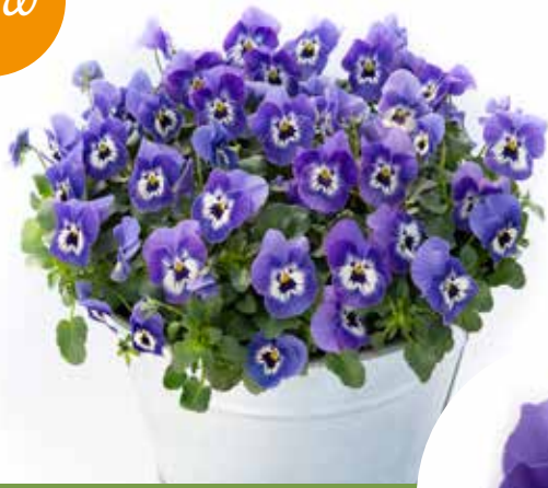
Deep Marina FBRE33