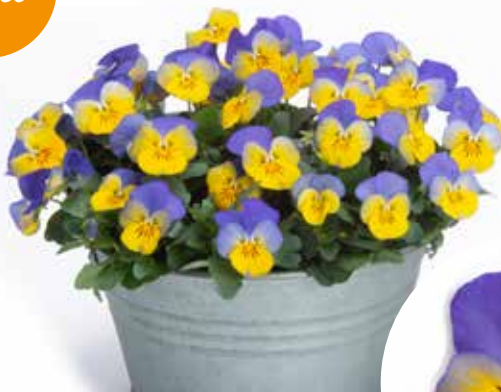
Yellow Blotch Wing FBRE23