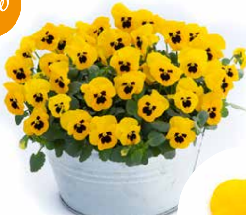
Yellow Blotch Early FBRE27