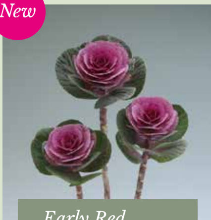
Early Red FHB687

A new addition to this Crane series is the Early Red. Crane series excel in cold climates with uniform, upright growth and compact flower heads that allow size adjustment via spacing.