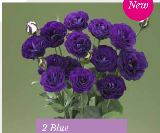
2 Blue FRS905

Five new varieties were added to the Croma Lisianthus series that showcases elegant, rose-like flowers with high doubleness, offering a touch of sophistication to any arrangement. Medium-sized blooms, sturdy stems and thick petals ensure easy handling and transportation, adding to its market value.